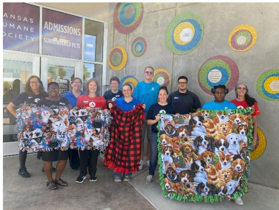
AmeriCorps 9/11 Service Day on September 20, 2024